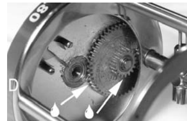
Lightly lubricate as indicated above