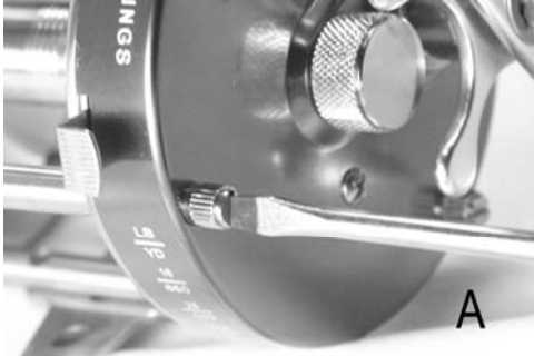
Remove side plate